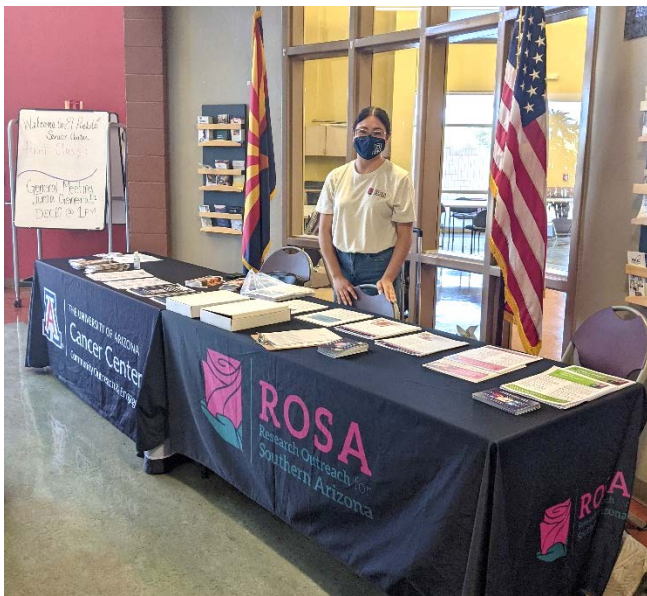
Community Basic Science Survey Recruitment