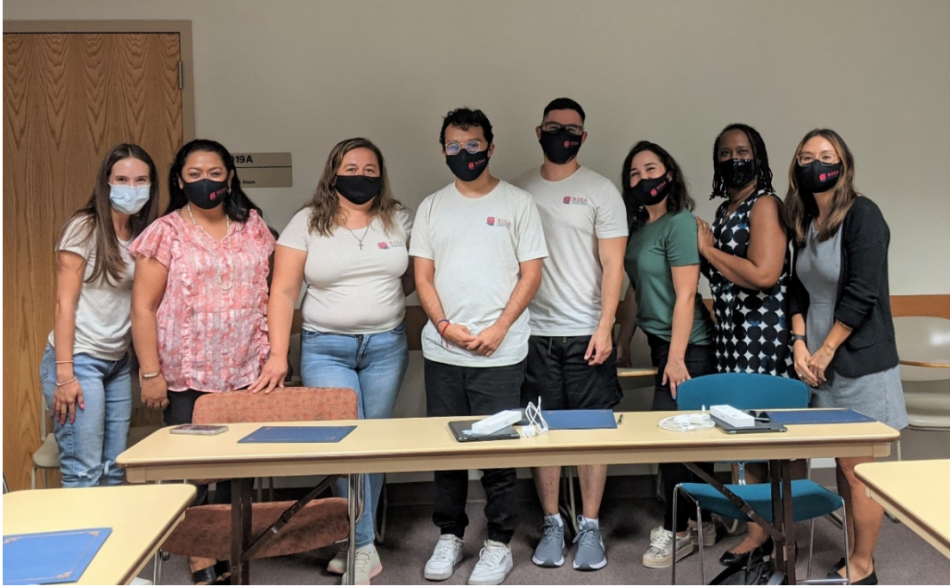
First Cohort of ROSA Ambassadors, August 2021