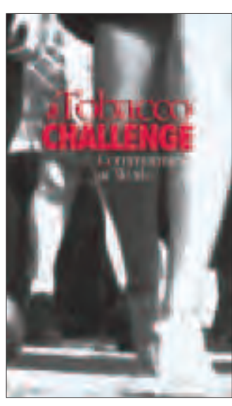
Informational brochure accompanying ASSIST-produced video The Tobacco Challenge: Communities at Work

advance groups. The ASSIST Strategic Planning Subcommittee took the lead in establishing the advance groups to address the issues of funding; technical assistance and training; surveillance, research, on; and advocacy opportuninatives from ASSIST and tes, California, and ACS nembership of the advance