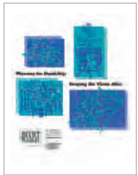
ASSIST manual for training session on durability