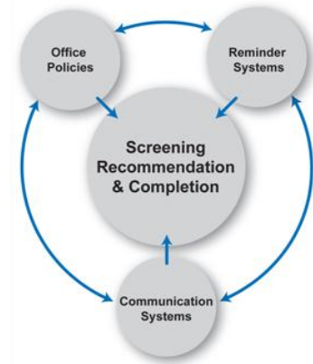
Figure 1. Office-systems Approach to CRC Screening

3.2. Preliminary Studies. Our research team has been working with CHCs to increase CRC screening rates for 4 years. We began with formative research to assess the acceptability of a collaborative model similar to the HDCC. In a June 2006 focus group, CHC providers indicated they would be more receptive to an approach involving on-site assistance than to one involving a collaborative model, which they felt was too burdensome. In response, we changed our strategy to one that combines an office-systems toolkit and an outreach specialist (see Description of the Implementation Strategy ). Using feedback from 2 more focus groups, we reduced the length of the CRC toolkit developed by the National Colorectal Cancer Roundtable from 116 pages to 30 pages and retained only those tools that were deemed appropriate for CHC settings and populations (see toolkit in the Appendix ). Because CHCs serve many uninsured patients, focus group participants felt that FOBT/FIT was the only feasible approach until colonoscopy becomes affordable for all. Many CHCs have safety net arrangements with local gastroenterologists to perform colonoscopy for patients who have a positive stool test. We have negotiated similar arrangements in other studies involving safety-net health care providers (U01CA114629).