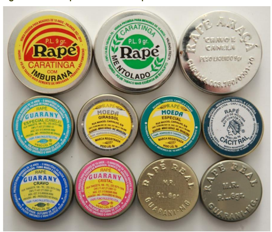
Figure 9-4. Examples of Brazilian rapé

In Brazil, regional ST products include a type of dry snuff called rapé (Figure 9-4). Rapé is used primarily in rural areas and small towns, or by Brazilian aboriginals in the Amazon rainforest, and cultural and historical elements are connected with its use (Andre Luiz Oliveira da Silva, unpublished results, 2012). Preliminary data from analysis of Brazilian rapé in 2011 show that the major constituents of the rapé samples (tonka bean, clover, cinnamon powder, and camphor) are unique compared with components of other smokeless products (Andre Luiz Oliveira da Silva, unpublished results, 2012). Since this product is mostly sold locally and in cottage industry settings, typical pricing information and evidence-based literature on the manufacture and use of rapé are not readily available.