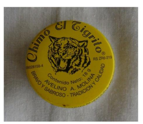
Figure 9-3. Examples of chimó product from Venezuela

Chimó is the main ST product used in Venezuela (Figure 9-3). Chimó is typically used by placing a small amount under the tongue or between the lip or cheek and the gum, and left in place for about 30 minutes. The black-stained saliva is then expectorated.<sup>36</sup>