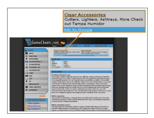
Cigar accessories advertised to "Halo 2" players

performance of music, commercial film or video, or video game " (emphasis added).<sup>80(p.18)</sup> Cigar manufacturers, however, are not parties to the MSA between the major cigarette firms and 46 state attorneys general.