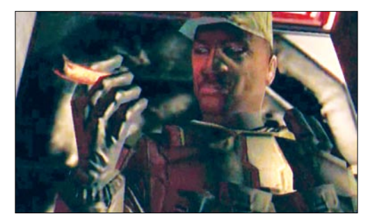
Xbox game "Halo 2" character Sergeant Major Avery Johnson with cigar

In the first level, as soon as you get off the lift do not go on the train. Instead, look to your right to find a trash can. Go over to it, crouch, and look in between the can and the wall. There should be a Johnson Cigar burning away. Additionally, go to the armory. As you are coming up the stairs, you will hear the man shooting his shotgun and talking. Kill the Elites and go through the door. Jump over the turret and look to the right. Jump on the lights sticking out of the wall, then jump over the rail. Get on one of the beams